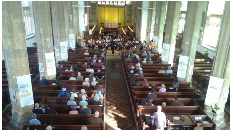
The Rusty Players performing in Cromer Parish Church on their recent tour of North Norfolk.