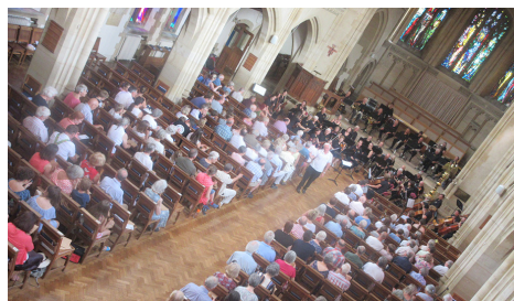
The Rusty Players performing in Oundle School Chapel at the 2018 Oundle International Festival